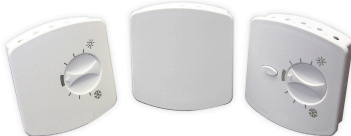
STE-6014W80 STE-6010W80 STE-6017W80